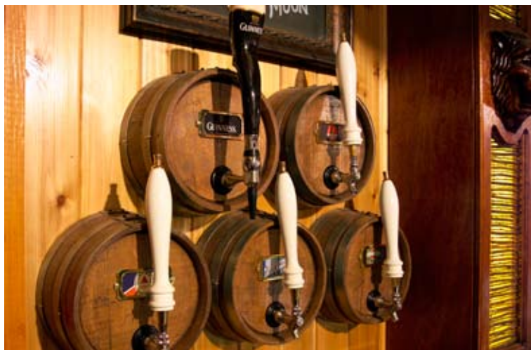
a few of the beers on tap at Hemingway's Lodge