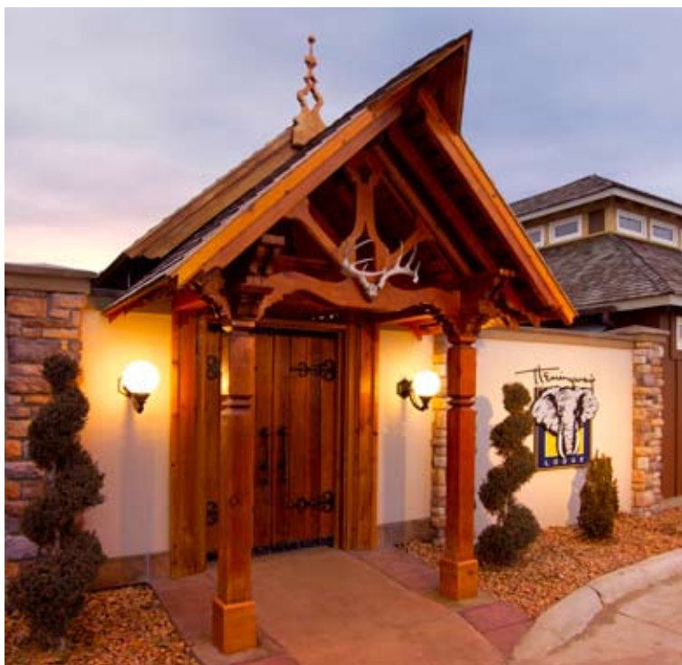
the new entrance to Hemingway's Lodge