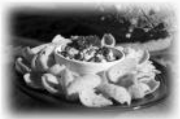
California Bean Dip served with corn chips ~ $3.95

Take a trip out West with our two new dips: