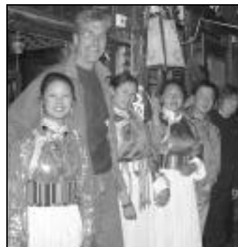
Singing waitresses in a popular restaurant in Lijiang, China