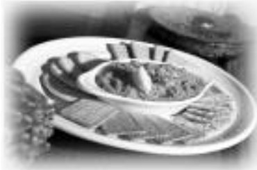
Napa Valley Artichoke Dip served with assorted gourmet crackers ~ $4.95