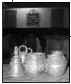
Cast bronze pots from India

Deb adds,“Traveling also makes you appreciate your home and all our Western conveniences!”