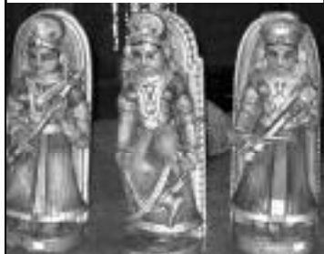
Carved stone musicians, part of an Indian temple.

“We love trying to find unique, amazing,unusual antiques and art to bring back to Northwest Iowa,to share with people a little bit of the world we don’t get to see every day.”