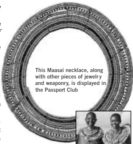
This Maasai necklace, along with other pieces of jewelry and weaponry, is displayed in the Passport Club

Next time you're in the Passport Club, browse through the large coffee table book called Maasai , filled with gorgeous photos and lots of great information about this special people of Africa.