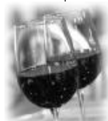
Try a glass of our featured wine - 2002 Pinot Noir Willamette Valley - with our scrumptious signature salmon. It's the perfect complement to this dish.

Combine the vinegar and shallot in a saucepan. Cook until reduced to half. Remove from heat. Cut butter into small pieces and whisk in 3 or 4 pieces, one piece at a time. Return pan to low heat and continue whisking in the remaining butter. The sauce should have the consistency of a light mayonnaise. Whisk in the raspberry jam. Serve immediately (warm).